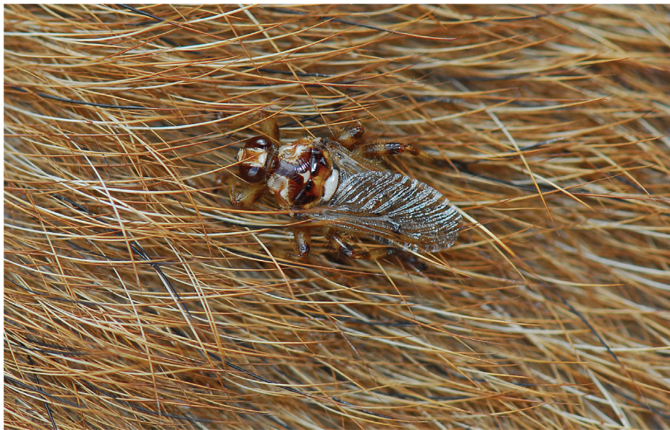
Fig. 2. Hippobosca longipennis identified on one of the dogs examined in the present study. [Colour figure can be viewed at wileyonlinelibrary.com ].